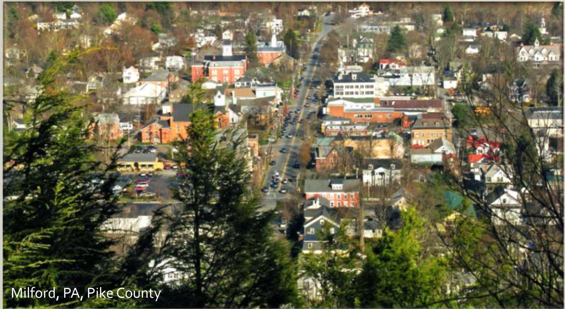
Milford, PA, Pike County